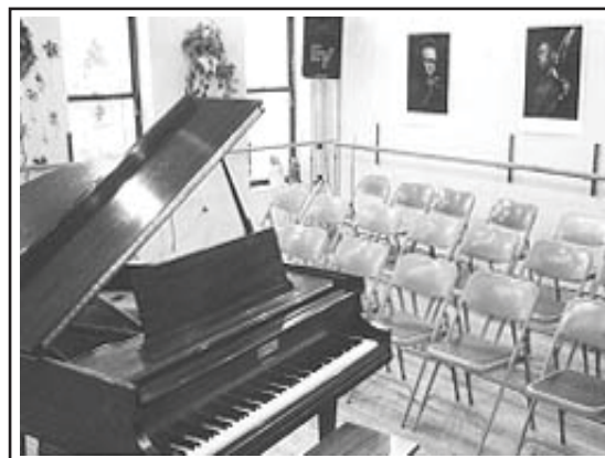
The intimate Manna House Mini-Theatre

film, "Trumpet of Glory." He conducts seminars in Singapore, Japan and the USA. He performs regularly at The Blue Note and other local jazz venues. He starts a concert tour in Japan in February 2011.